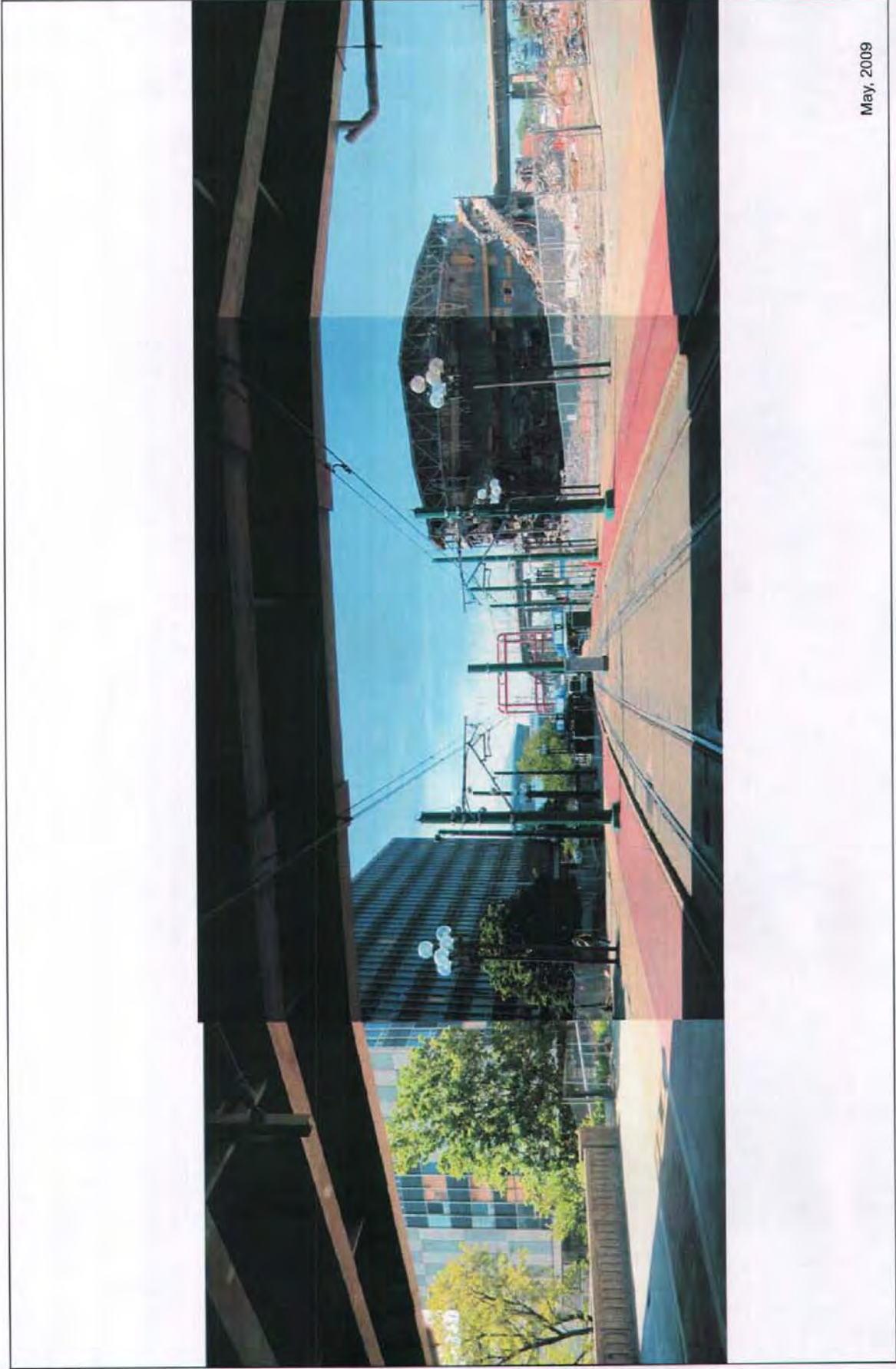
Canal Side Project Buffalo, New York