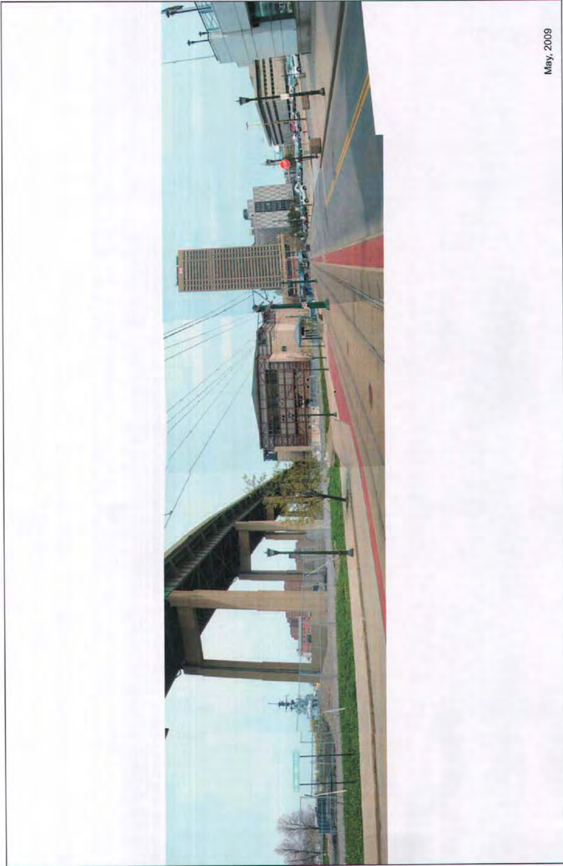
Canal Side Project Buffalo, New York