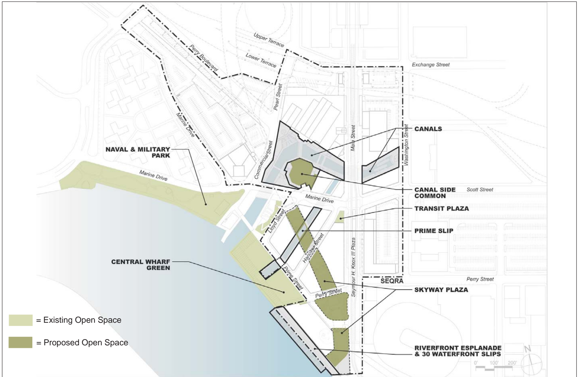
Canal Side Project Buffalo, New York