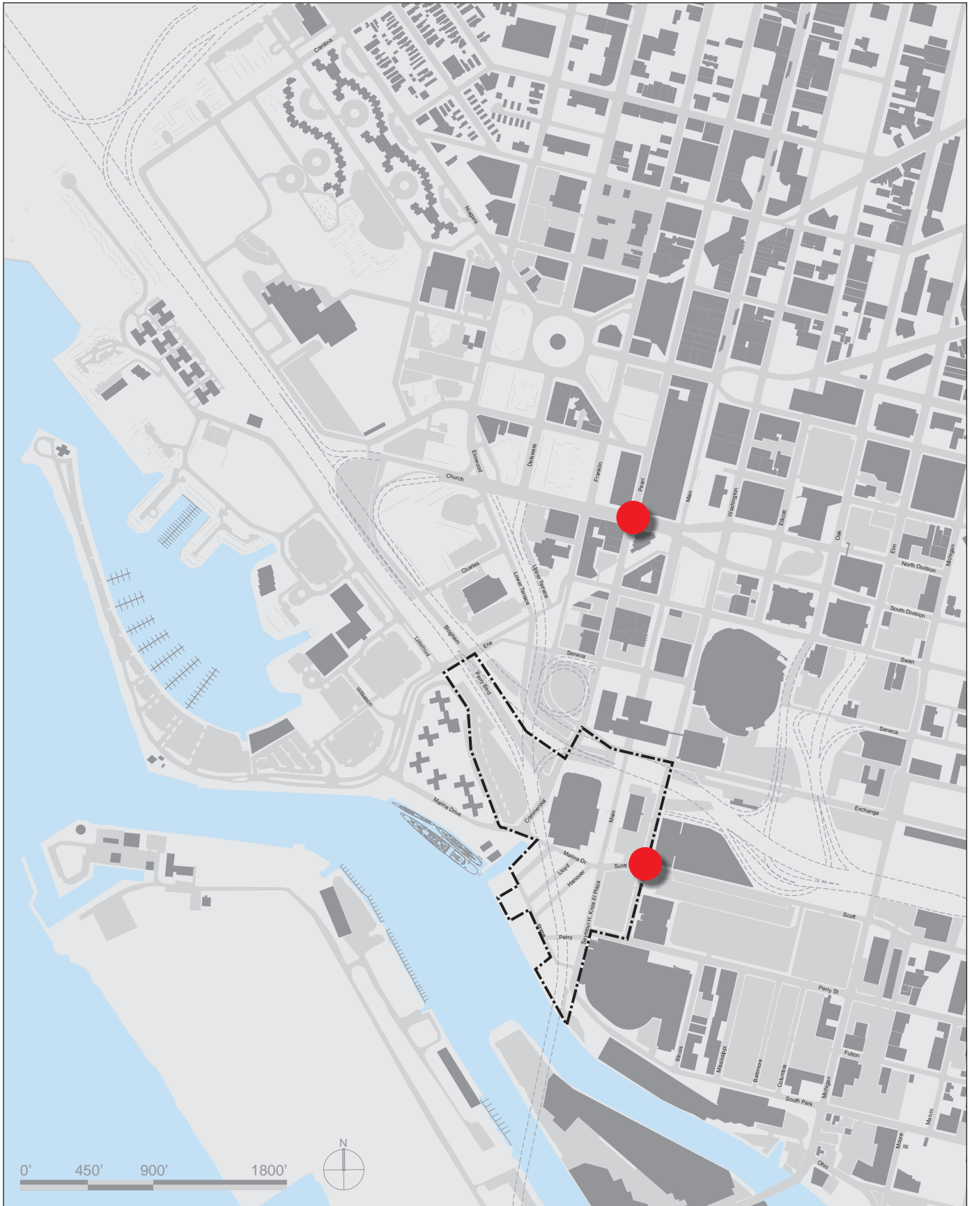
Canal Side Project Buffalo, New York