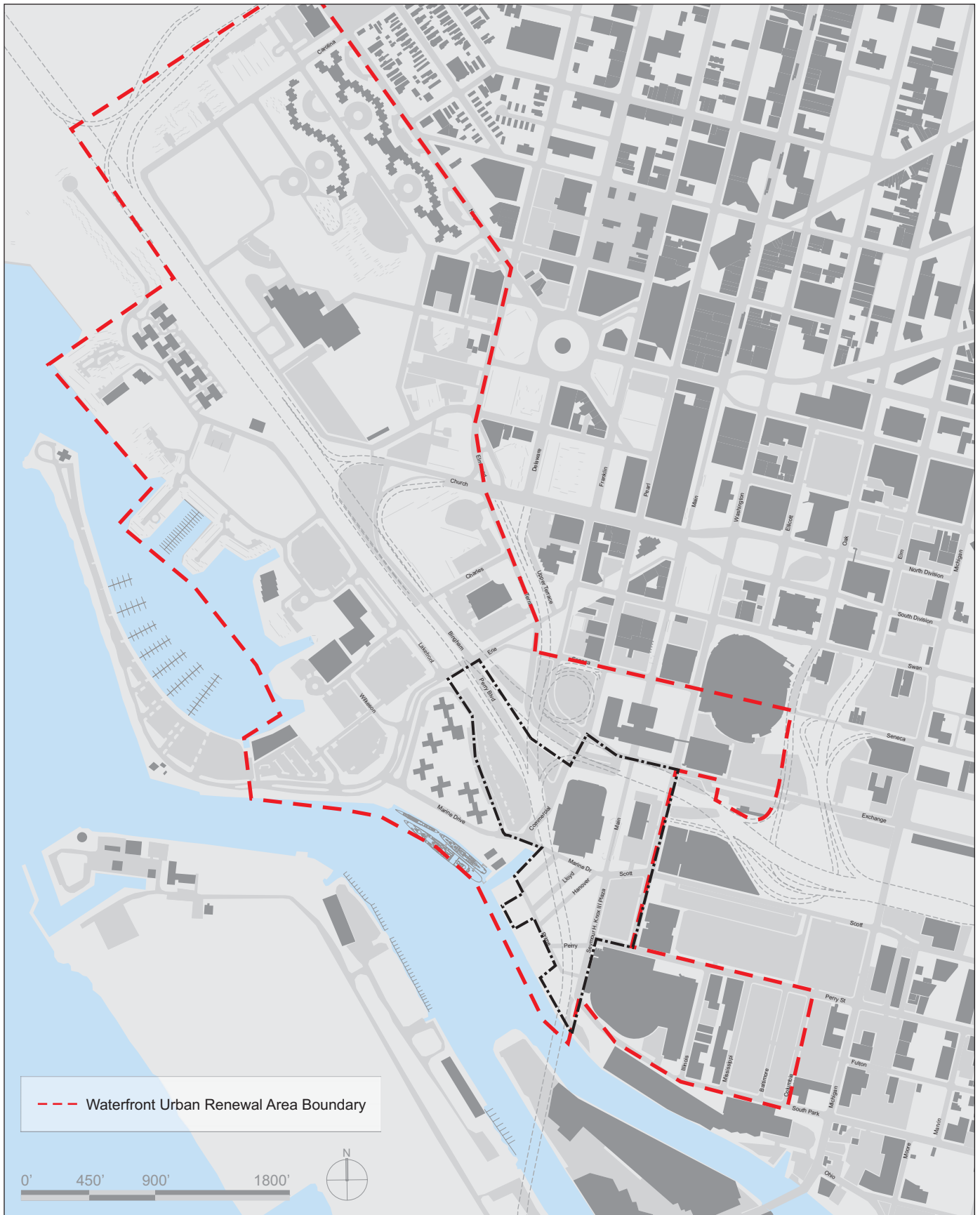
Canal Side Project Buffalo, New York