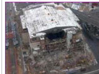
Aud demolition continues on schedule!